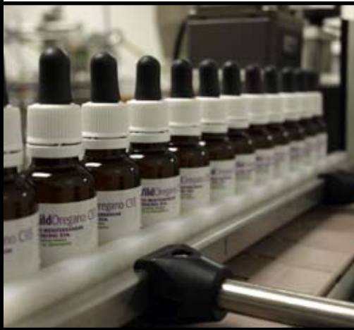
Capped and labelled bottles