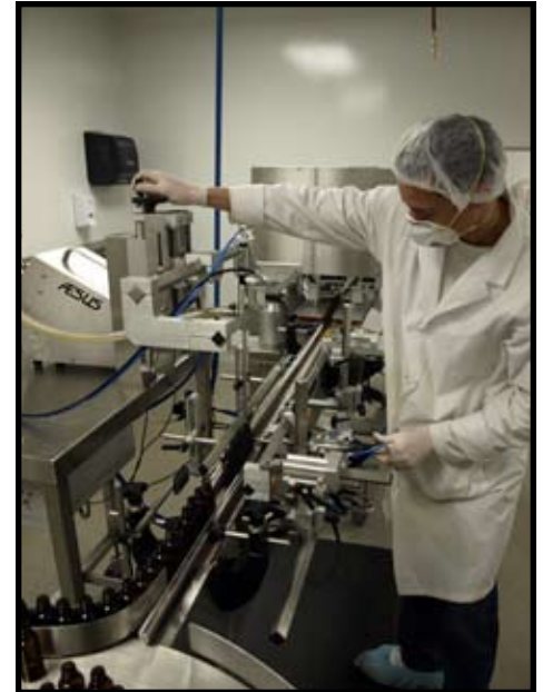
Adjusting the amount of liquid