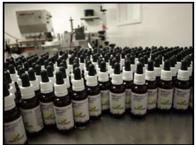
...where they will be picked up to be boxed!