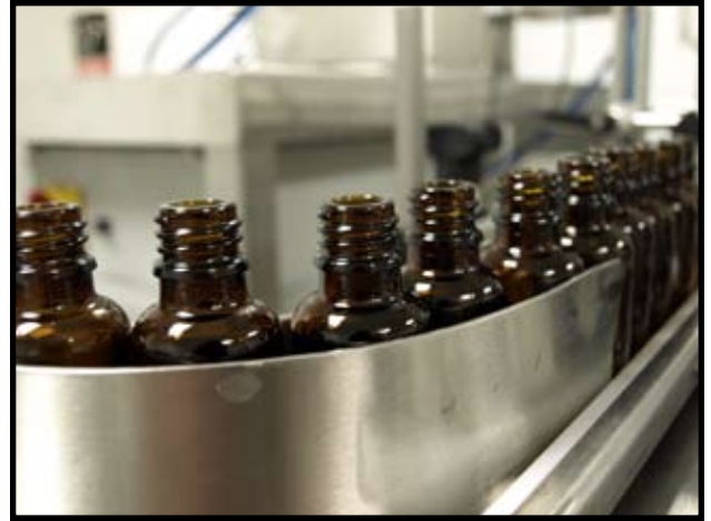
...that feeds them to a conveyor belt...