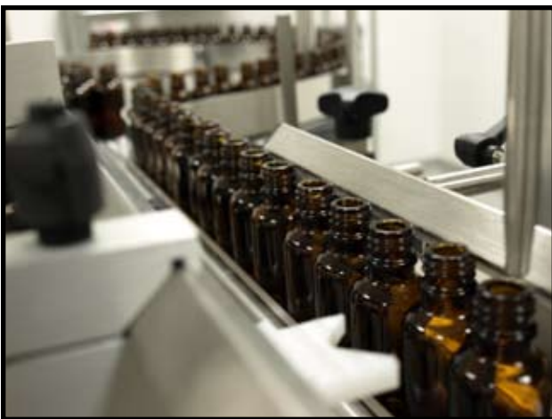
Another close-up on the filling section