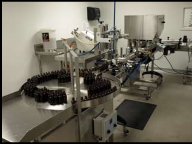
Bottles are loaded onto a rotating infeed table (left)...