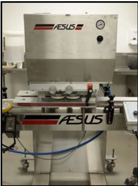
The capper portion