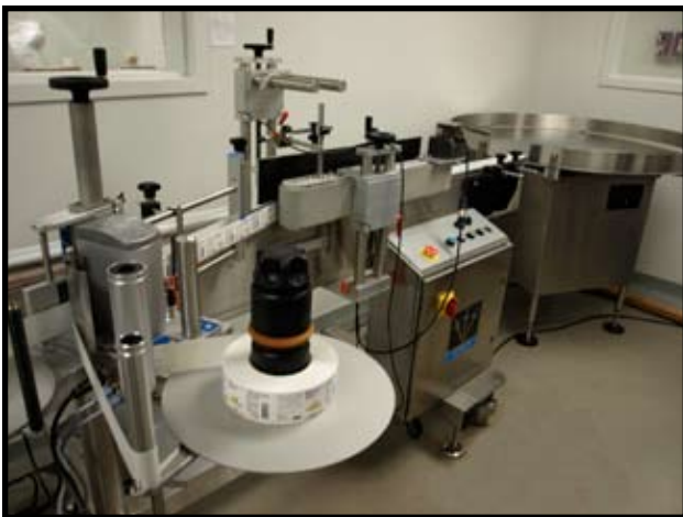
The automatic labeling machine