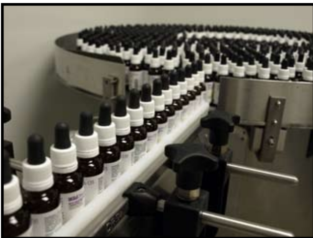
Bottles are delivered to the rotating collection table...