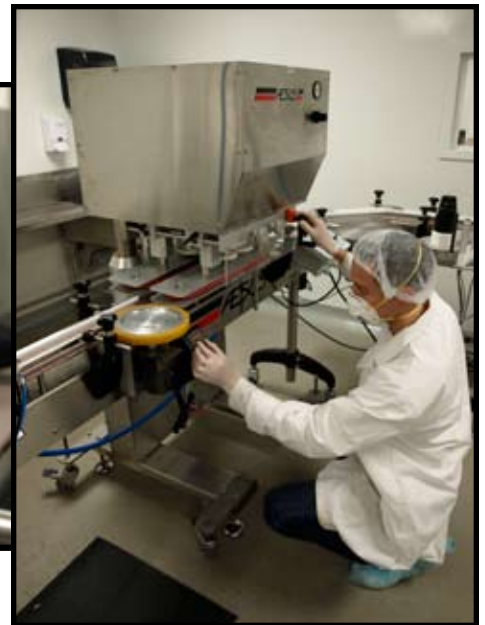
Adjusting the capper