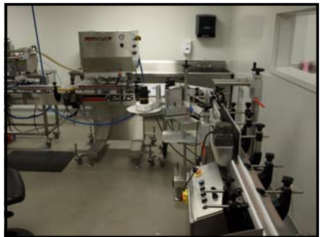
Then bottles move on to be capped and labeled