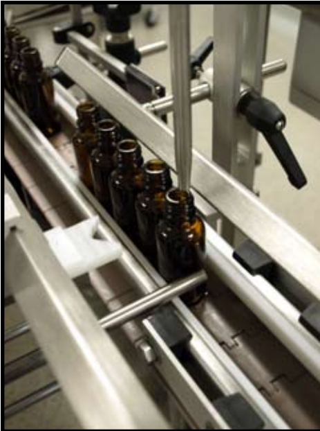
...where the bottles are filled by a digital pump.